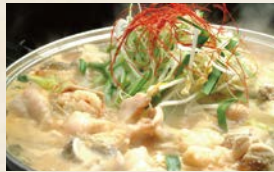
3. Offal Hot Pot ¥1,227 Tax included ¥1,350