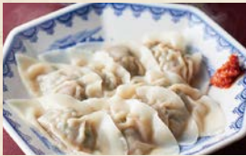
2. Boiled Dumplings ¥636 (5 per person) Tax included ¥700

The picture is four servings. Two orders minimum.